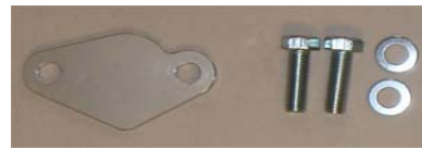
EGR Block Off (Manifold)

Hardware: 2 - 8mm x 1.25 x 20mm Hex Bolt 2 - 8mm Flat Washer