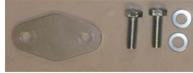
EGR Block Off (Head)

Hardware: 2 - 8mm x 1.25 x 20mm Hex Bolt 2 - 8mm Flat Washer