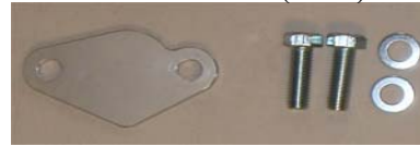
EGR Block Off (Manifold)

Hardware: 2 - 8mm x 1.25 x 20mm Hex Bolt 2 - 8mm Flat Washer