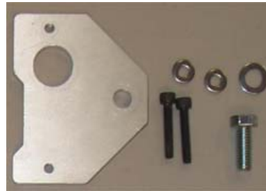
Map Sensor Mount Plate

Hardware: 4 - 10-24 x 3/8" Flat Head Allen 2 - 6mm-1.00 x 20 Flat Head Allen