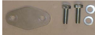
EGR Block Off (Head)

Hardware: 2 - 8mm x 1.25 x 20mm Hex Bolt 2 - 8mm Flat Washer