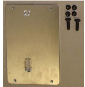
Ignition Coil Mount Plate