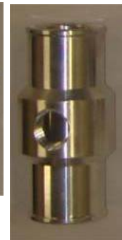
Water Temp Sender Relocator

Hardware: 2 - 10/24 x 1 Allen Screw 2 - #10 Flat Washers 1 - 8mm x 1.25 x 20mm Hex Bolt 1 - 8mm Flat Washer