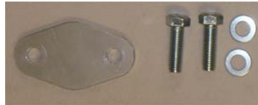
EGR Block Off (Head)

Hardware: 2 - 8mm x 125 x 20mm Hex Bolt 2 - 8mm Flat Washer