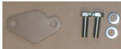
EGR Block Off (Manifold)

Hardware: 2 - 8mm x 125 x 20mm Hex Bolt 2 - 8mm Flat Washer