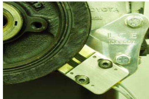
Hall Sensor Mount

Hardware: 2 - .400" Spacer 1 - 1/4" Spacer 2 - M8 Wave Washer 1 - M8 - 1.25 x 80mm HEX 1 - M8 - 1.25 x 85mm HEX