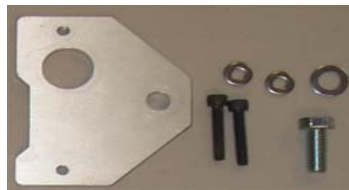
Map Sensor Mount Plate

Hardware: 2 - 10/24 x 1 Allen Screw 2 - #10 Flat Washer 1 - 8mm x 125 x 20mm Hex Bolt 1 - 8mm Flat Washer